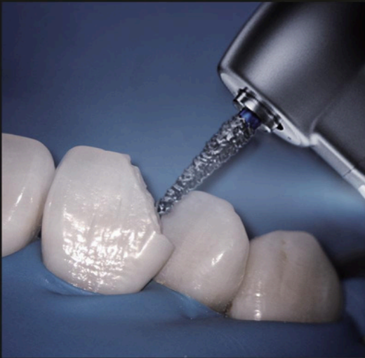
Aesthetic restoration (1:5 )