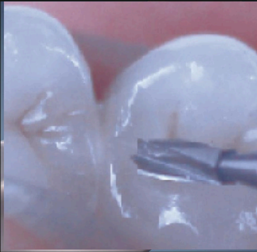
Grinding &fine polishing (1:1)